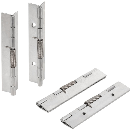
Hinges with closing spring